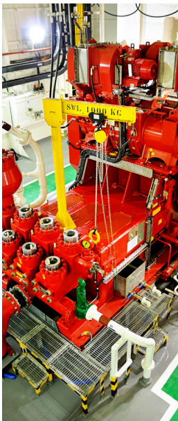
Figure 1. Blow-Out Preventer

Hazardous location limit switches are used in a variety of industrial applications, ranging from mud pumps, valve positioning, and pig position detectors to gate/door monitoring in grain conveyors and grain gates. Here are several examples of how these switches are used in hazardous or explosive environments.