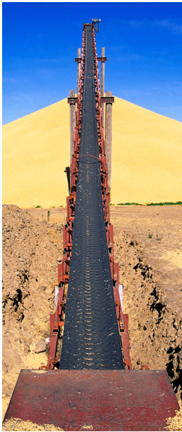
Figure 2. Grain Conveyor