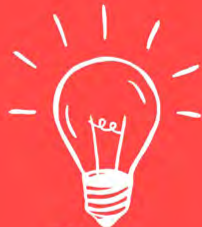
We Embrace Visionary Thinking

Our core values guide us in decisions big and small. These values matter to us. They are how we engage internally as well as with our customer and supplier partners. We work hard to create and support a culture that sustains these values. Our values truly connect and inspire us.