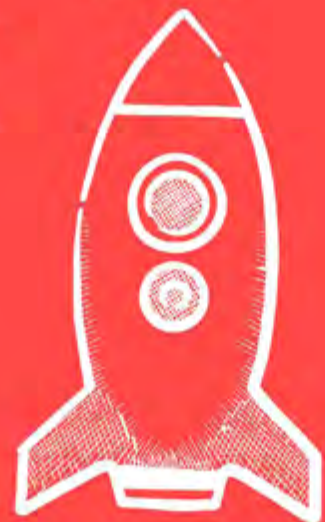
We Are Entrepreneurial