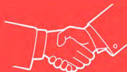
We Are Dedicated & Loyal

WHEN YOUR BOTTOM LINE IS TRUST, WORKING TOGETHER IS ALWAYS A WIN-WIN